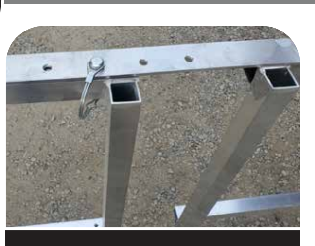
ROOF TOP HANDRAIL CONNECTION

ROOFTOP HANDRAILS CONNECT AT CENTER WITH LOCKING PIN