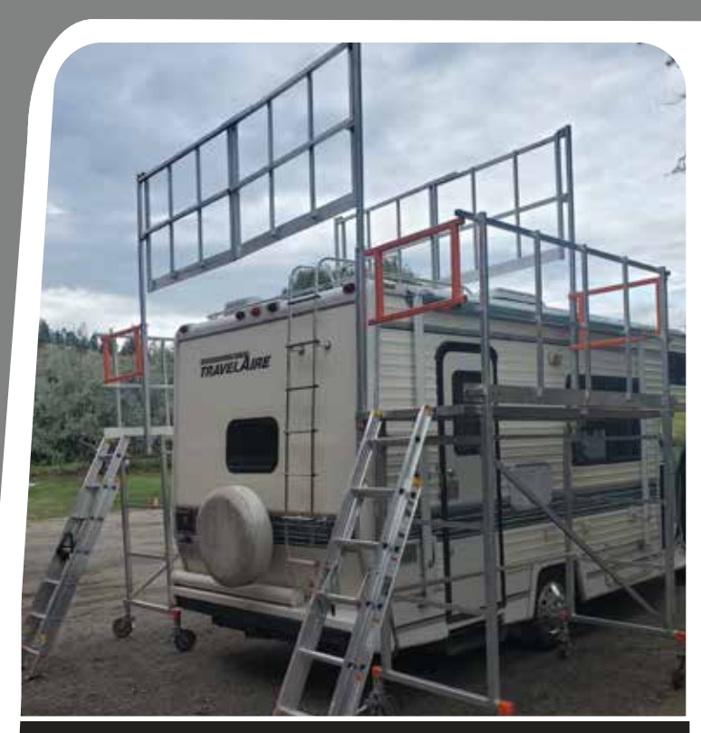
TWO ADJUSTABLE TYPE 1 LADDERS INCLUDED

FIXED OR ADJUSTABLE 6' 6" TO 9' HEIGHT SYSTEMS - 6" HEIGHT ADJUSTMENT SECTIONS