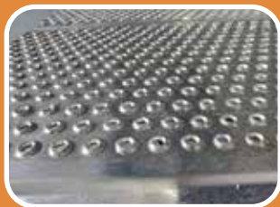
PERFORATED DIMPLE STEP SURFACES