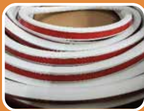
DECK & LOWER PADDING