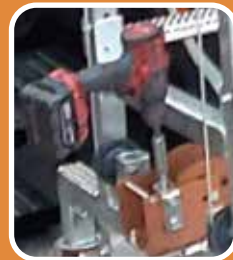
WORM GEAR WINCH POWER