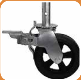
8" DOUBLE LOCK WHEELS