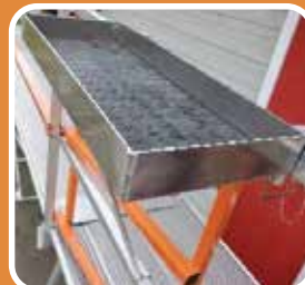
OPTIONAL TOOL TRAY